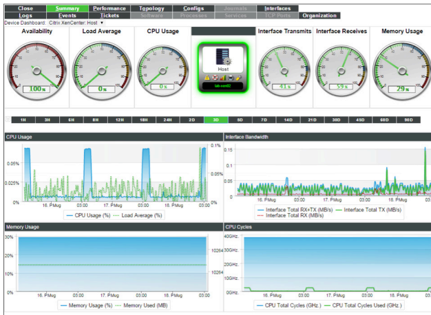
XenCenter device summary dashboard shows dials for current conditions and trends on historical performance

The XenCenter PowerPack includes four pre-built device summary dashboards for XenCenter elements and three pre-built dashboards included for XenServer performance.