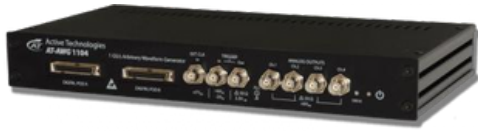
16 Bit – 1 GS/s Arbitrary Waveform Generator