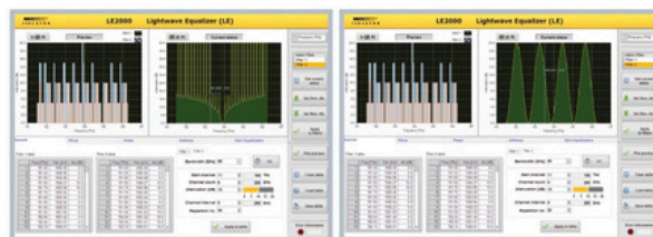
Graphic User Interface